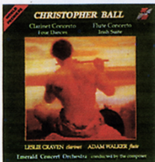
QUANTUM CD 7040